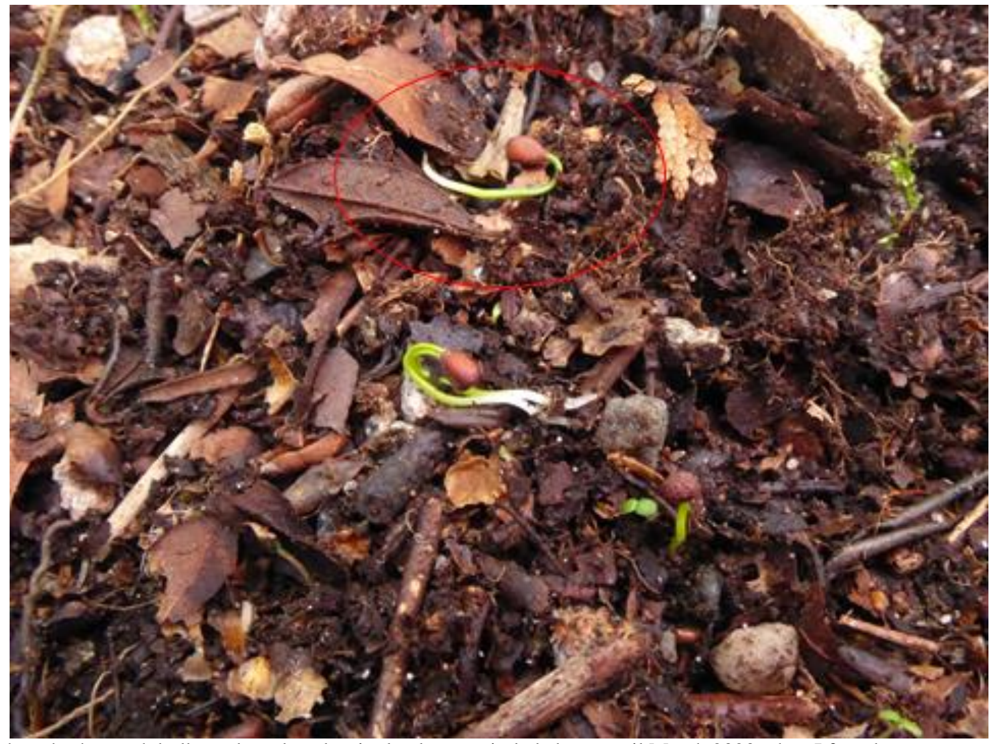
I thought that each bulb seed produced a single plant as circled above until March 2020 when I found two monocotyledons emerging from a single Erythronium seed also seen above.