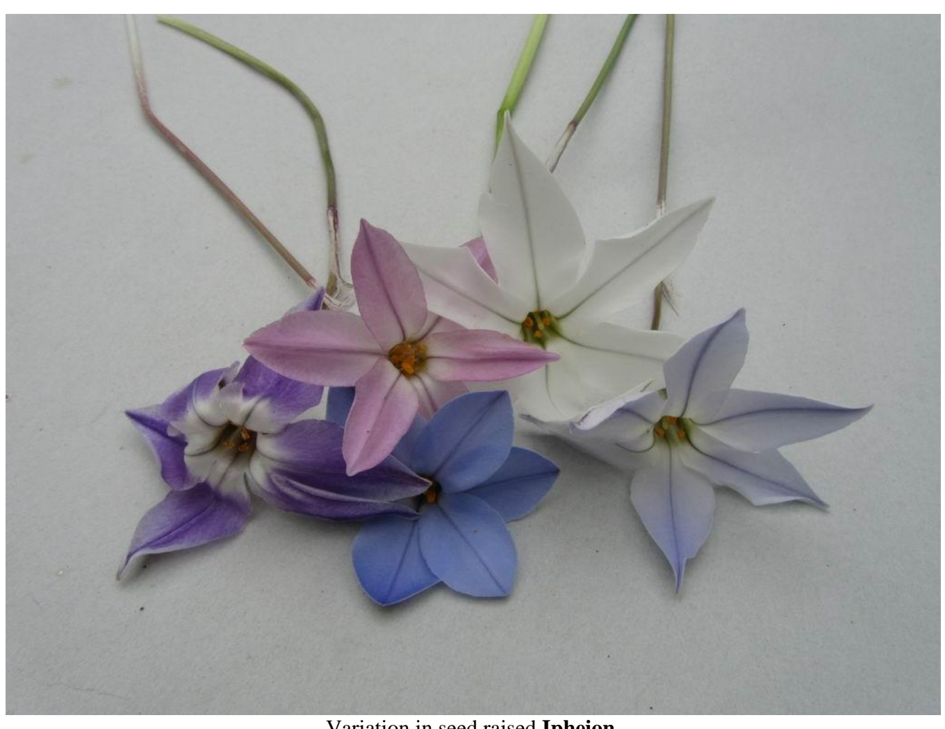
Variation in seed raised Ipheion .