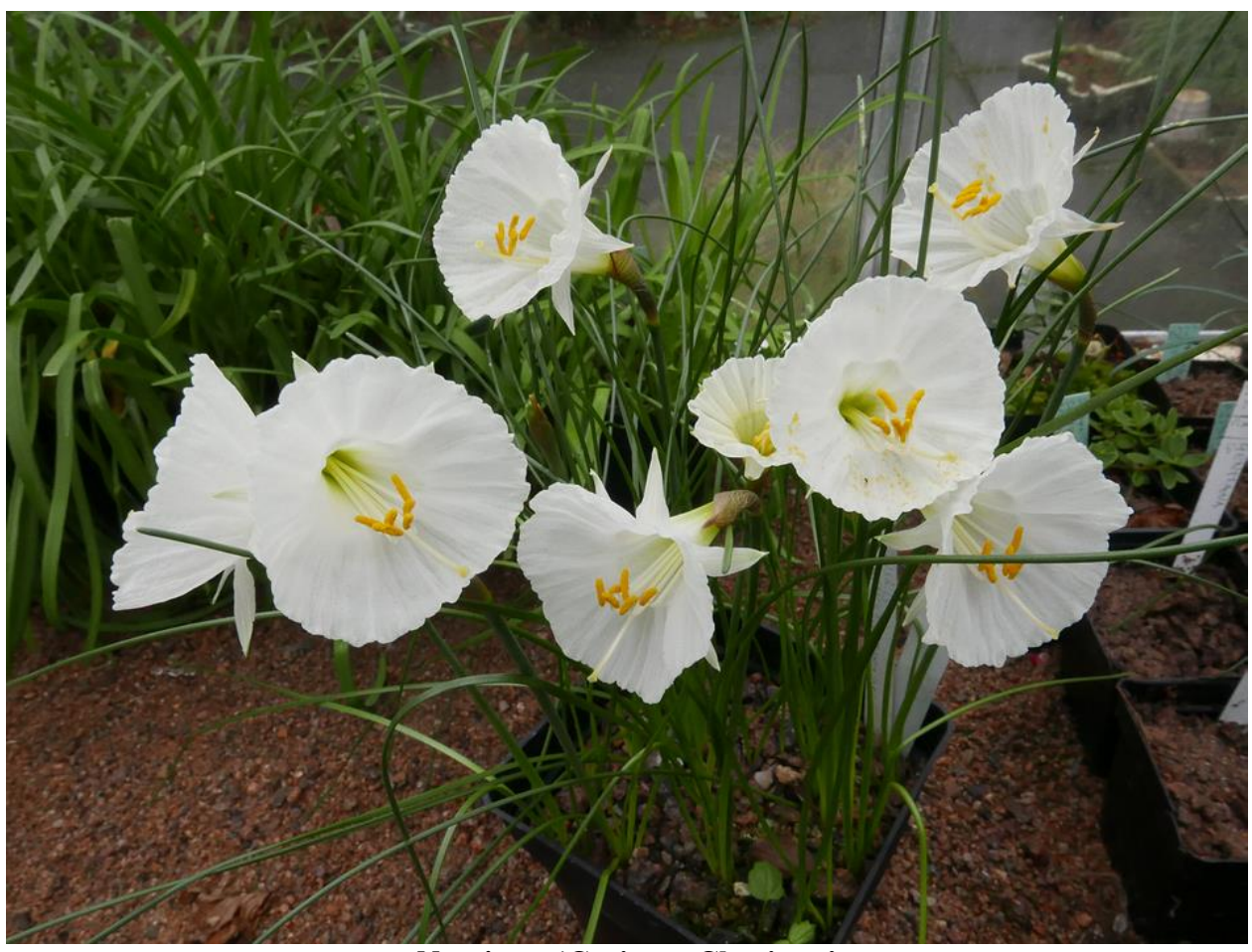
Narcissus 'Craigton Chorister'

the energy for flowers. Growing groups of seed raised bulbs allows for cross fertilisation and will always result in a better seed set while a single clone grown in isolation may not produce any.