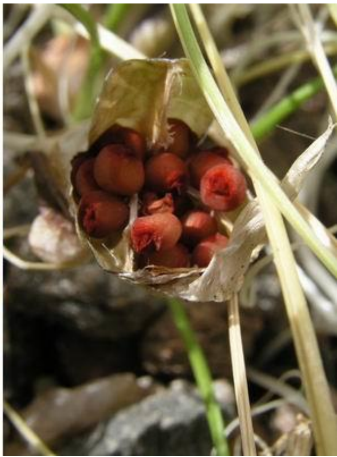
Crocus seed pods

Crocus are another group that do best if planted deep and again we can start to see the link between how the seed is dispersed in the wild and at what depth we should be planting the seed. Many crocuses also have the sticky appendage attached to the seed and there are some crocus seed pods that do not come above ground, certainly in cultivation, even when they are ripe and open.