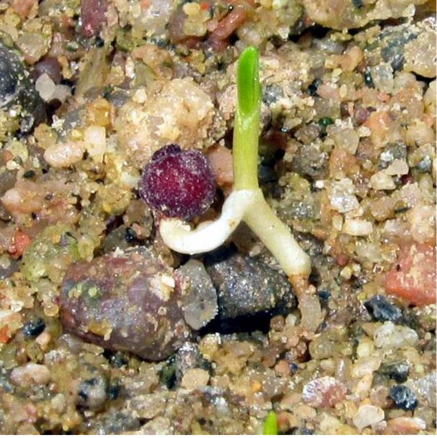
Crocus seed germinating