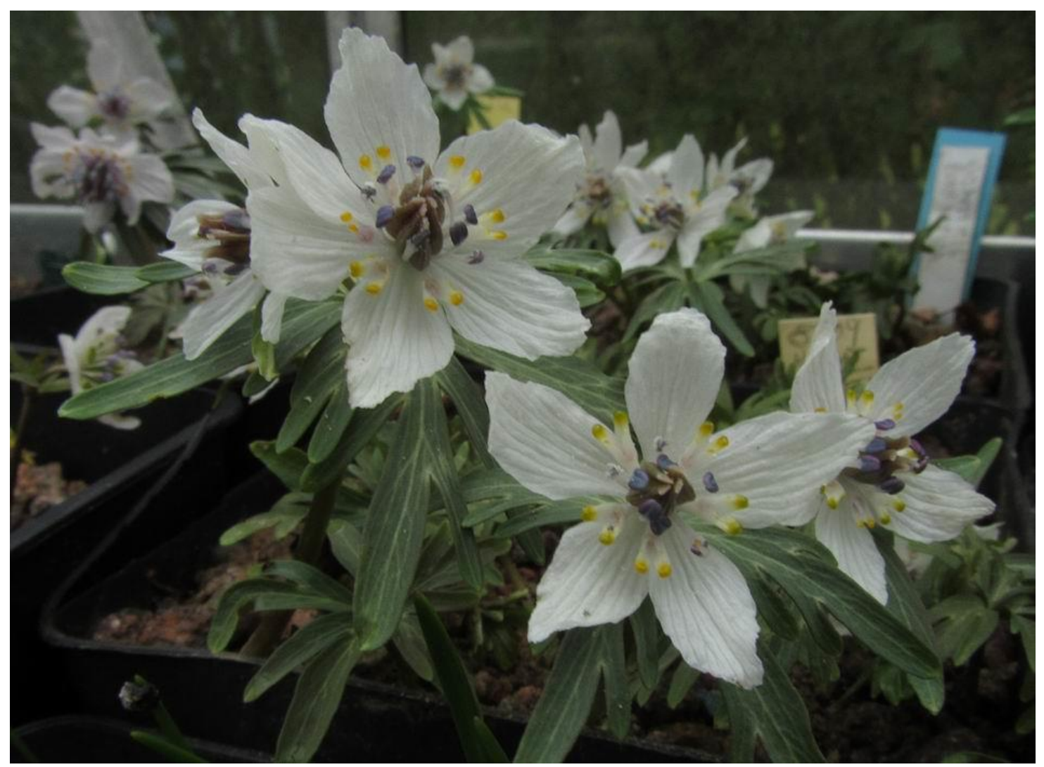
Another of the many plants that I am taking through this process of building up numbers and acclimitising through successive generations of garden collected seed is Eranthis pinnatifida .