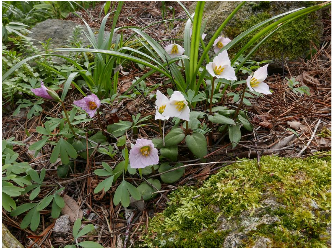
It was through this same seed method that we established Trillium (Pseudotrillium) rivale in the garden, now we have several colonies seeding around in the different habitats.

In time we built up enough Eranthis pinnatifida plants to feel we could risk planting some directly into the garden and now we are letting them self-sow. My main aim is to have bulbs growing and forming self-seeding colonies in the garden that is when I feel successful and the only way to achieve that is to raise them from seeds.