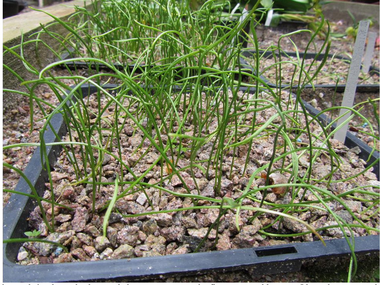
I sowed the seeds in plunge baskets and above you can see the first year seed leaves – I kept them watered and provided occasional half strength liquid feeds to keep them growing as long as I could before the went dormant.

them in your garden because only the seedlings that can tolerate your conditions will thrive and every subsequent generation of seedlings from your own garden seed will become more adapted to your growing conditions - I call this 'climate shifting'.