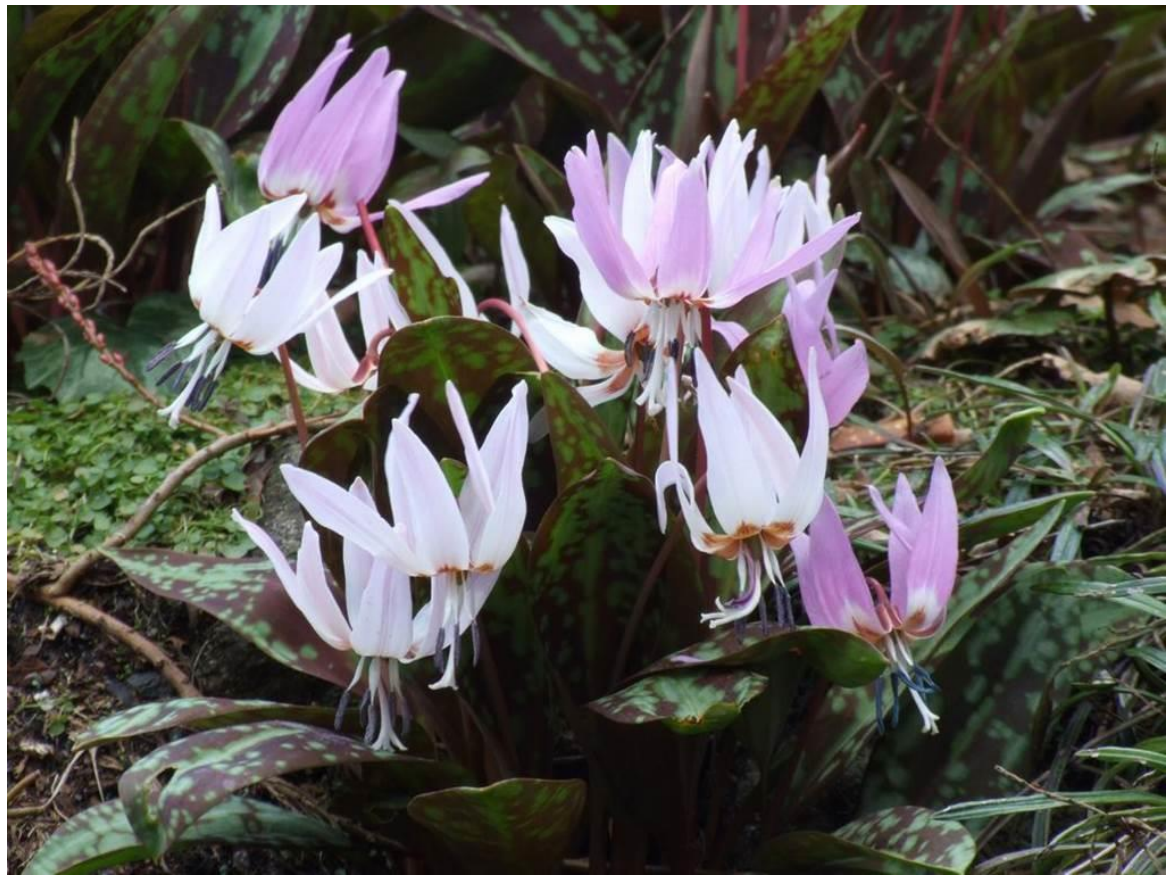
Erythronium dens-canis grown from garden collected seeds showing lovely variation in colour which looks so much nicer than a single form would.

I am often asked why I do not copy nature and sow the seeds immediately they are ripe to which I answer that you must consider all the facts before you draw conclusions. In nature seed is shed into a climatic season that provides a generally warm dry environment. When the seed ripens in our garden the weather can be cold and wet and remain so all summer long which can cause fresh-sown seeds to rot, so by storing the seeds in paper packets, kept warm and dry for the summer, then sowing them in late August I am imitating, as closely as I can, the conditions that the seeds experience in nature.