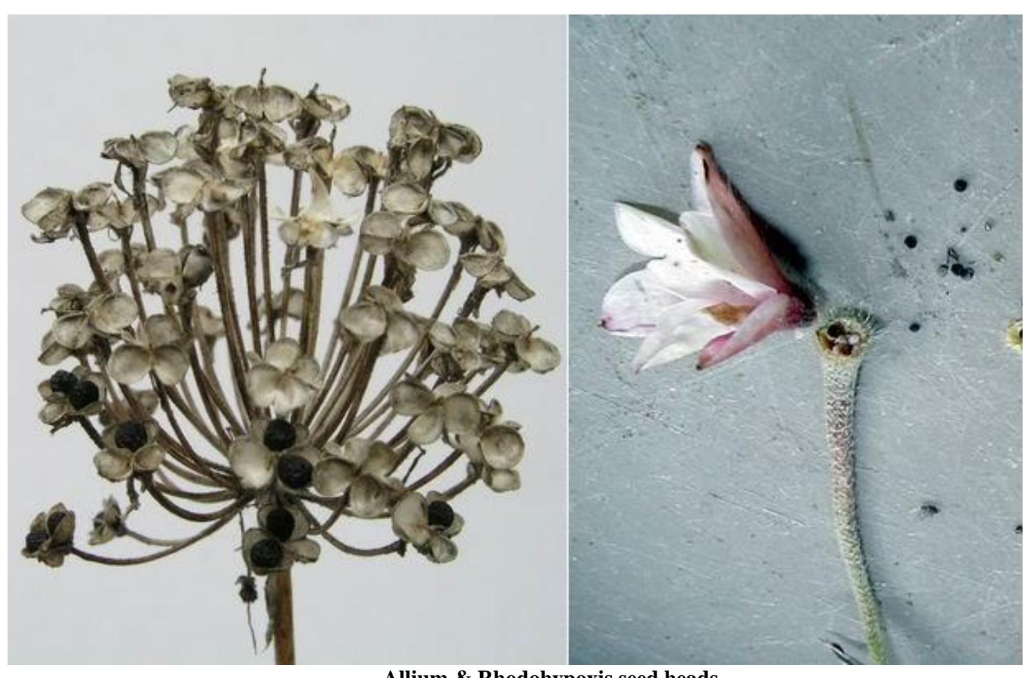
Allium & Rhodohypoxis seed heads

As I look at more of the bulbs we grow I am now starting to be able to predict whether it is best to surface sow the seed or sow at depth. On the left is a typical Allium seed head which, you will observe, hangs onto the seed for a long time even after it has opened unless it gets broken off by the wind and then it gets blown around, tumbleweed style, shedding some seed each time it is knocked. On the right, the Rhodohypoxis seed just seems to fall to the ground and I have not worked out how else it might get dispersed so I surface sow these two types.