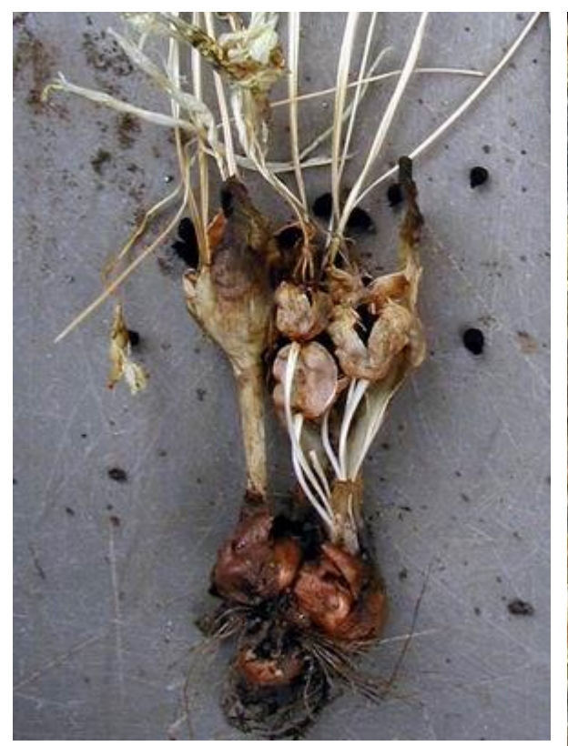
Crocus caspius seed pods where the top tip of these seed capsules was just below the gravel top dressing.

Crocus are another group that do best if planted deep and again we can start to see the link between how the seed is dispersed in the wild and at what depth we should be planting the seed. Many crocuses also have the sticky appendage attached to the seed and there are some crocus seed pods that do not come above ground, certainly in cultivation, even when they are ripe and open.