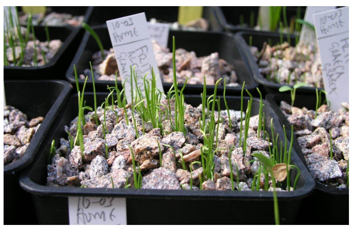
Fritillaria seed germinating.

Look how deep these first year Fritillaria bulb seedlings, seed of which was sown on the surface, have taken themselves in their first year of germination – one is even escaping through the bottom of the pot. Learn this lesson from the bulbs and never be afraid when you are replanting small bulbs to place them that bit deeper - they will be able to get their leaves up to the surface.