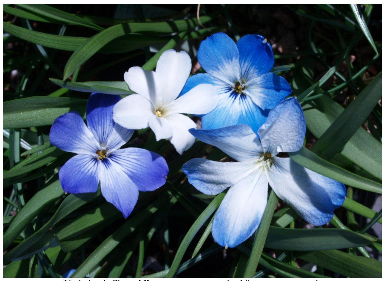
Variation in Tecophilaea cyanocrocus raised from our own seed.

diseases so you are less likely to lose all such seedlings, if a problem strikes, than if you had the same quantity of a single clone. Another advantage gained from seed raised bulbs is that they will be more suited to your growing conditions, simply because any seedlings that were totally unsuited will have died off at an early stage. It is much less painful to lose a first year seedling or two than to lose a flowering bulb bought at great expense which you find is not suited to your cultural methods or garden conditions.