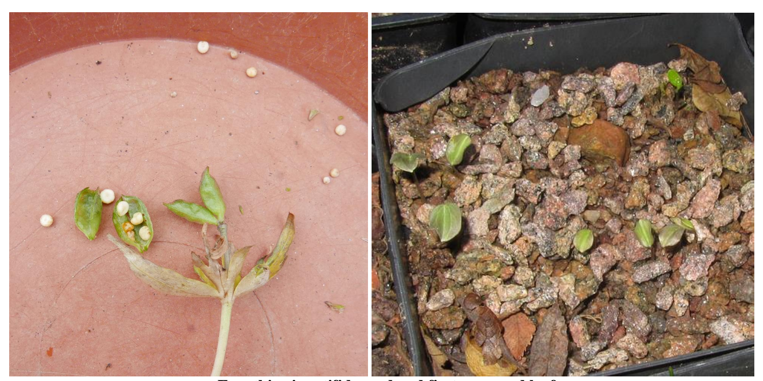
Eranthis pinnatifida seed and first year seed leaf.

Once more we started with just a few bulbs of this small beauty which provided us with the seeds to increase our stocks then in subsequent years I found a source and brought in some new seed to increase our genetic pool.