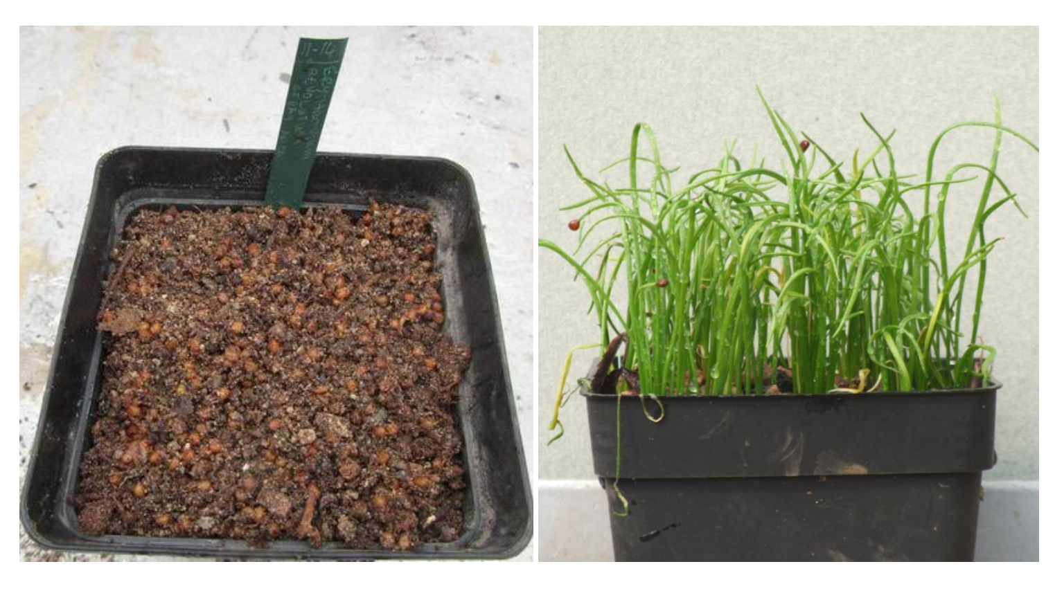
After soaking I sow Erythronium seed on the surface covered in a layer of gravel. If the seed is sown in the autumn it will give a good germination the following spring however seed that is received and sown in the spring will not give a significant germination until the following spring.

The method I use for soaking is to place the dry seed into a small plastic pouch to which I add a small amount of water - by the morning you should notice that the seeds have rehydrated, plumping up considerably.