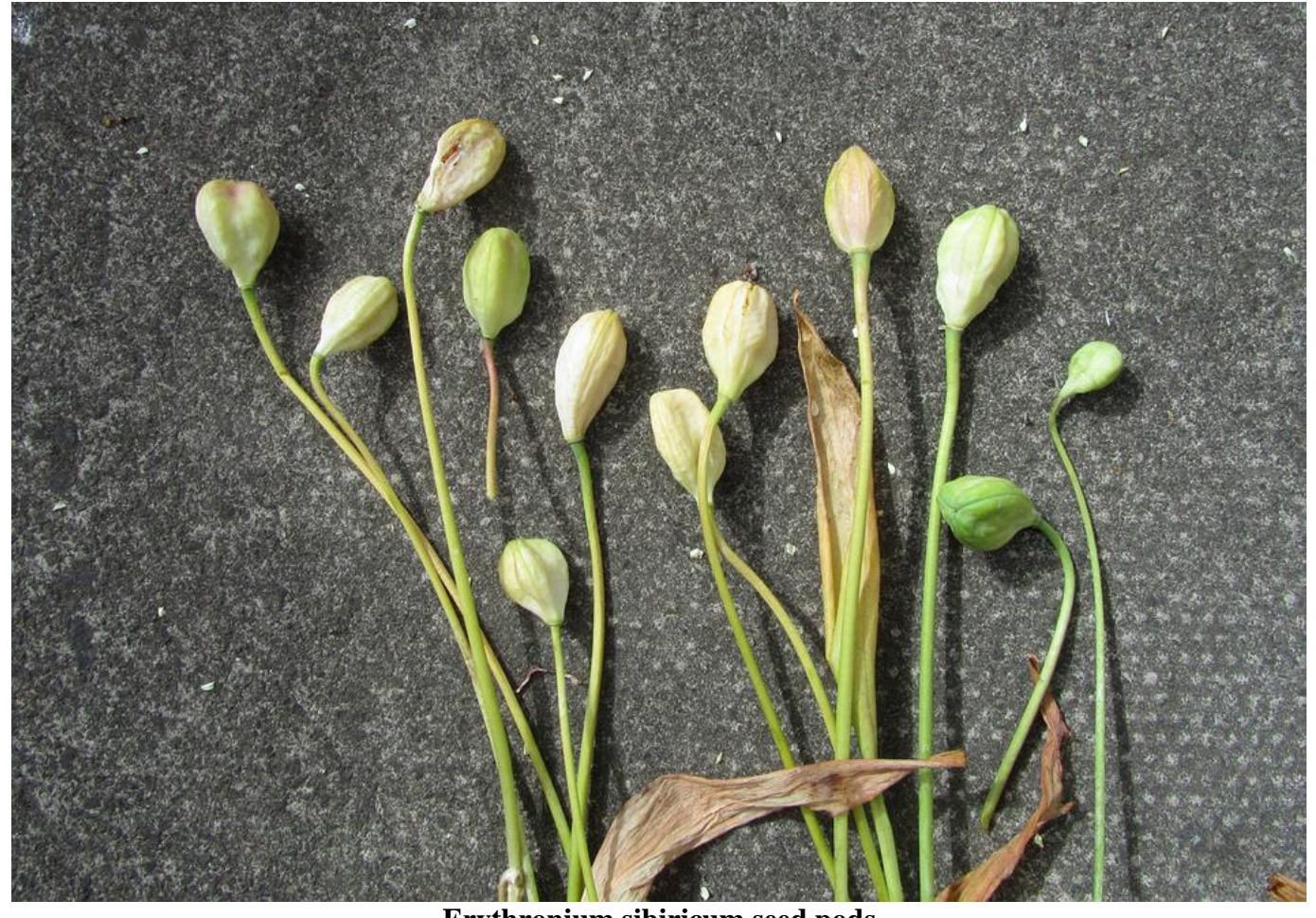
Erythronium sibiricum seed pods