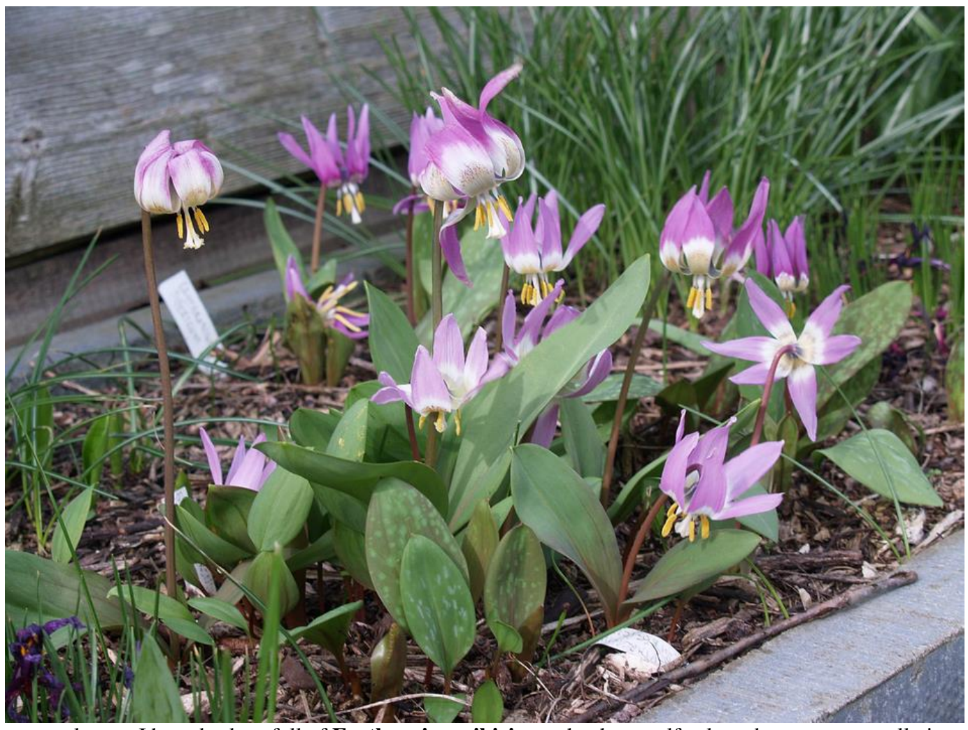
After several years I have baskets full of Erythronium sibiricum that have self-selected to grow normally in our garden conditions, flowering beautifully and in turn setting seeds for future generations.