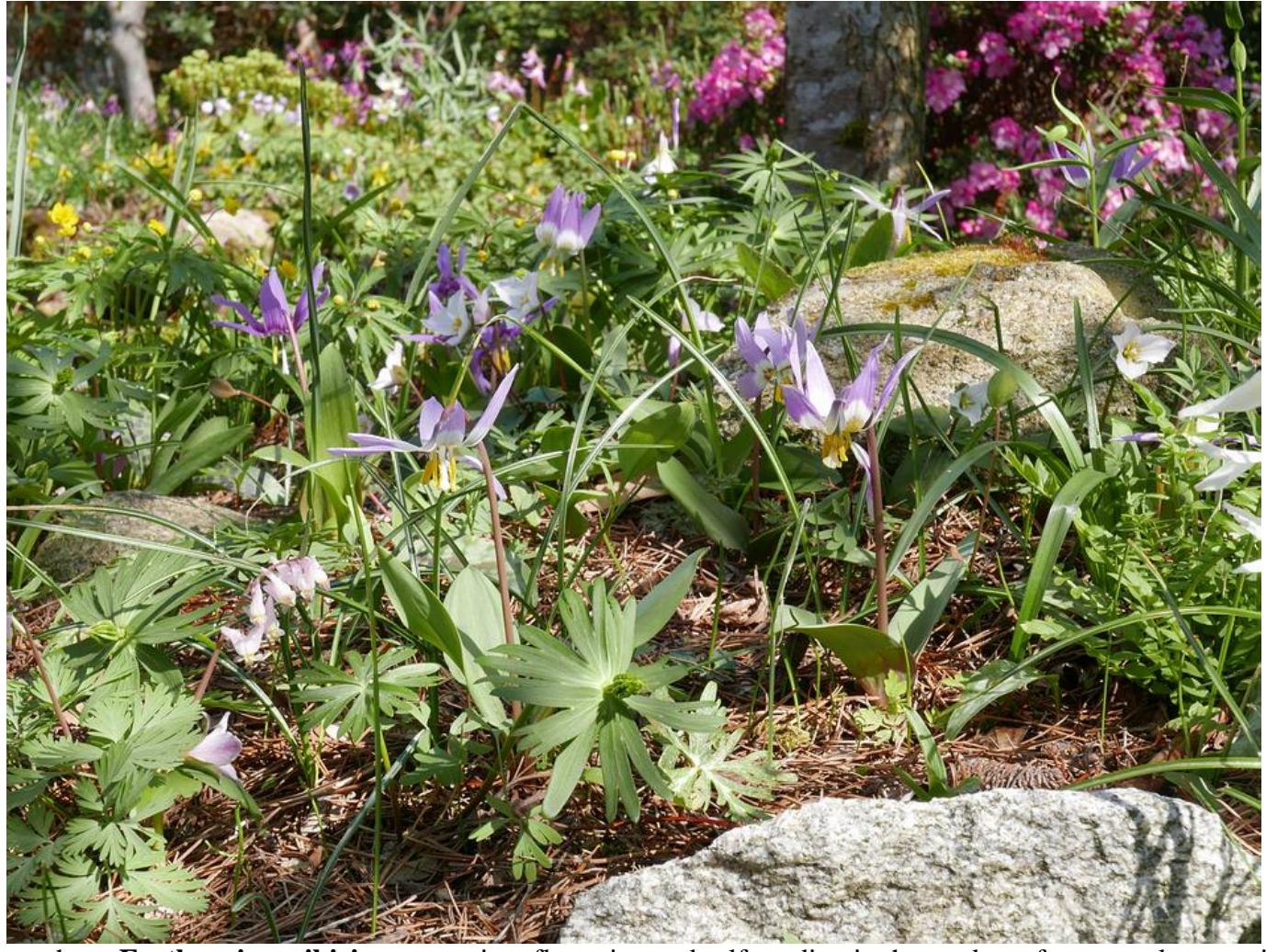
We now have Erythronium sibiricum growing, flowering and self-seeding in the garden, after several generations of garden seed.