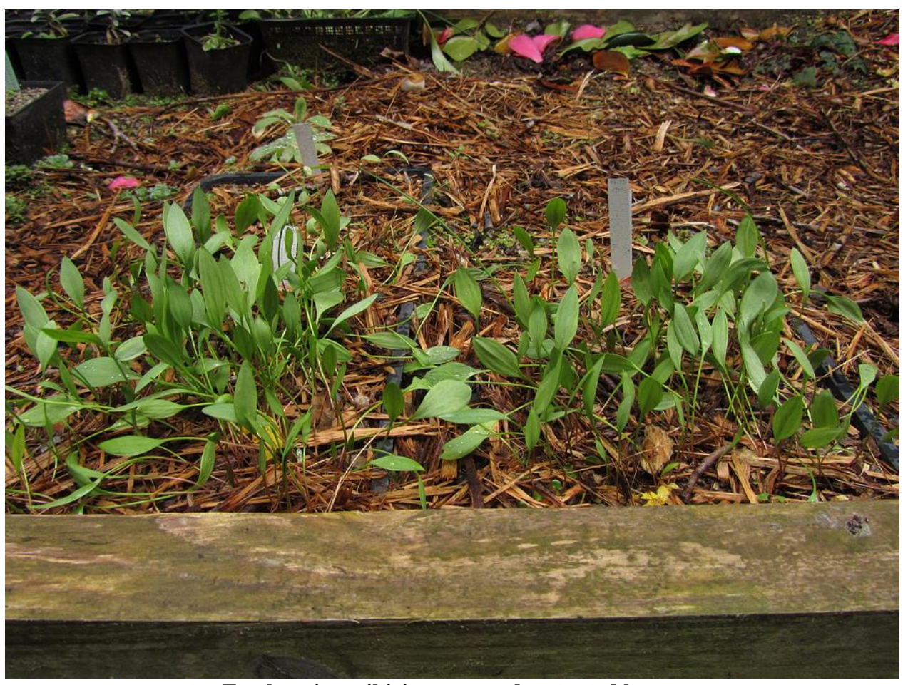
Erythronium sibiricum second year seed leaves